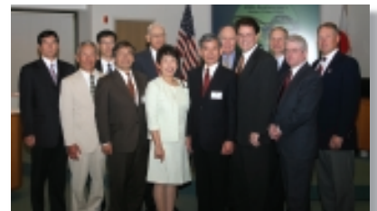
Midland City Council members greet Handa visitors

Midland gave six Handa, Japan, government representatives the red-carpet treatment when they visited our community in May 2006 to celebrate Handa and Midland's 25 th sister city anniversary.