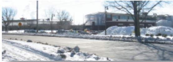
Dow Diamond Stadium Nears Completion