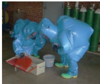
Firefighters train for Haz Mat situations

Calls for hazardous materials incidents were up 45 percent last year. This is likely due to the high amount of vehicle accidents to which the department responds. If anti-freeze or oil spills during a vehicle accident, the incident is considered a hazardous material call. Likewise, a chemical release or tanker spill is considered a hazardous material incident.