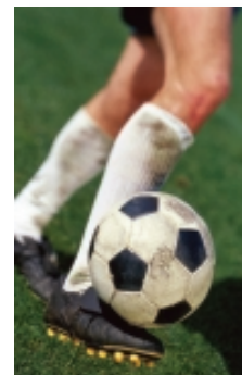
Soccer is a staple of MichiTario games, as is baseball, softball, hockey, and golf.

The 2007 MichiTario Friendship Games will take place in Midland. Call 989-837-6930 for more information.