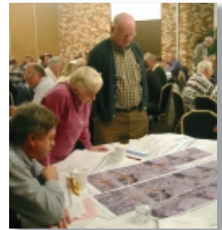
Design Series participants pore over proposed changes for Eastman

In January 2007, traffic engineering firm DLZ was hired to begin design work for the roadway improvements. In the coming year, City staff will work with DLZ on field surveys, preliminary designs, and the beginning of the right-of-way acquisition process. If all goes as planned, construction could begin in late 2009, with completion set for December 2010.