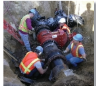
Crews work on water main installation

The two new agreements were initiated by both townships at about the same time. Larkin wanted to extend its existing water service area to include the northern-most part of the township. (A portion of Larkin had already been receiving City water through a separate agreement from 1997.) In the case of Mills Township, the community no longer wanted to rely on well water as its sole source of water.