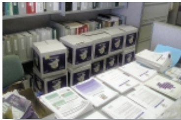
Meetings in a Box materials, ready for use