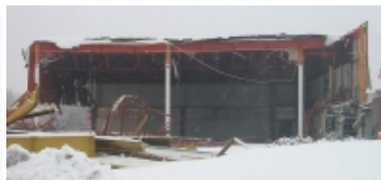
The old arena when open (far left) and now, in the demolition process (near left)