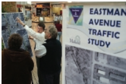
City engineers explain potential Eastman traffic solutions during Meeting at the Mall